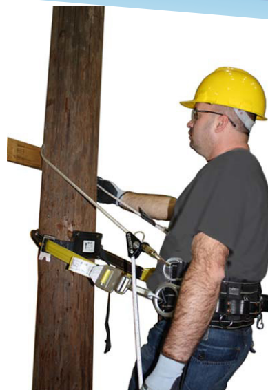
Miller Adjustable Rope Lanyard shown with the Miller StopFall™ Fall Restraint System

Meets OSHA 1926.502, 1910.66; ANSI A10.32, ANSI Z359.3-2007 and CSA Z259.11 class F requirements